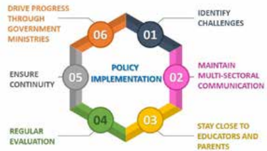
Figure 3: Proposed implementation of policy through a strategic action plan

The strategic action plan should address each goal by identifying challenges, communicating with the wider system through a multi-sectoral approach, maintaining strong links with educators and stakeholders, evaluating regularly the progress achieved, planning implementation over a specific period of years, and setting milestones involving different government ministries.