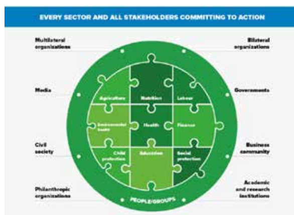
Figure 2: A multi-sectoral approach (NCF, 2018)

The working committee drafting this policy framework document were mindful that research evidence suggests that ECEC systems are more effective when approached through multi-sectoral collaboration. The European Commission and the Council of the European Union stress that a multi-sectoral approach allows “governments to organise and manage policies more simply and efficiently, and to combine resources for children and their families” (Communication from the Commission, 2011, p.7). Bringing various systems together and keeping the overall well-being of each individual child at the focus, would create shared understandings of the interconnected quality of the developmental process. Therefore, a multi-sectoral approach is permeated in each goal with a vision of facilitating the provision of high-quality ECEC and supports a more coherent and comprehensive collaboration across the many interconnected facets of the education and care of children.